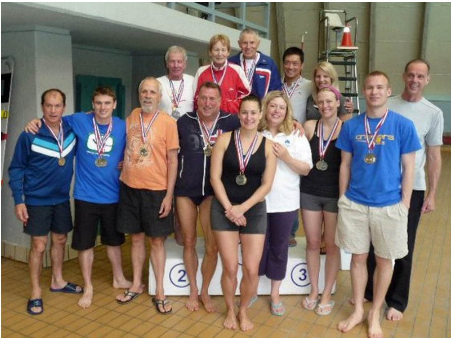
Some of the medallists at the Canadian Masters Invitational

From June 8 - 10, 2011, BC Diving hosted the Canadian Masters Invitational, in conjunction with the Irene MacDonald Invitational. The event was an outstanding success, with divers coming from Virginia and Arizona (USA), Sydney (Australia), and from Alberta, Manitoba, Quebec, and British Columbia. It was an exciting competition, with divers ranging in age categories from 18 - 24 to 80 - 84.